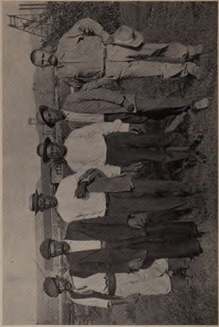
Six witnesses aggregating five nationalities Left to right: two Turks, a Trinidadian, a Jamaican, a Barbadian, an Italian